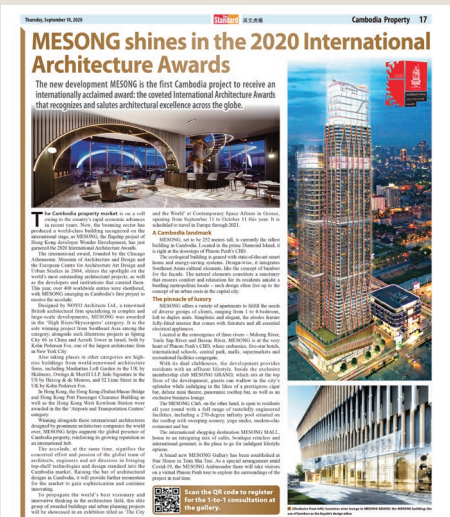
▲ News coverage in The Standard, 10 September 2020 獲獎報導，刊於 2020 年 9 月 10 日之英文文報

柬埔寨最大商業銀行 - 加華銀行的董事長方僑生先生得悉金匯項目獲獎後，亦有致函恭賀，對項目團隊於柬埔寨的建設上所付出的熱誠及努力表示肯定，並認同此次獲獎對於柬埔寨的發展帶往世界舞台有著重要意義。