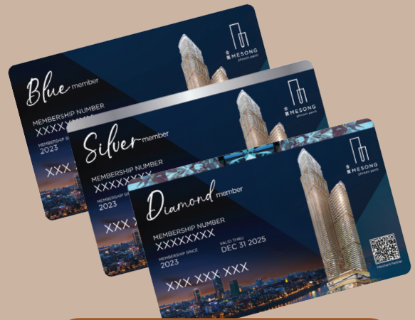
MESONG e-membership card 金匯MESONG尊屬電子會員卡

盈達發展以達成柬埔寨最優質和最高的建築為願景，致力為所有業主提供非凡居住體驗；同時亦走遍東南亞，攜手各地頂尖合作夥伴，為各尊貴業主提供一系列精彩的生活品味獎賞及體驗。全新推出的盈達發展尊屬電子會員卡讓各業主以尊貴身份盡享跨領域的禮遇，從非凡服務、商戶全年優惠、生日驚喜、尊貴禮遇，以至更多獨特的生活品味獎賞，均可全年享盡優惠。歡迎到訪盈達發展官方網站（ www.mesong.com/owner-privileges ）查看完整優惠清單，或向金匯MESONG銷售人員查詢有關優惠事宜。盈達發展將繼續與各知名企業、品牌和合作夥伴建立穩固的合作夥伴關係，以頂級品質昇華金匯MESONG的生活體驗。