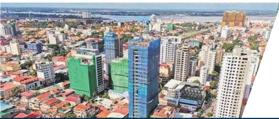
Growth potential will be fully realised drastically 全面帶動實體經濟及房地產市場發展

未來柬埔寨陸續有更多體育基礎設備相繼落成，除促進國內運動風氣及旅遊事業，更有助當地經濟發展，吸引更多相關機構、從業員以至遊客前往柬埔寨發展或觀光，全面帶動實體經濟及房地產市場發展。金匯MESONG亦於2023年落成，適逢東南亞運動會舉行期間，大大提振金匯MESONG 升值潛力及非凡價值。