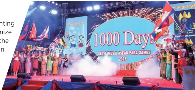
SEA GAMES & ASEAN PARA GAMES 2023 in 1000 Days 2023 東南亞運動會餘下 1000 日活動

With more sports infrastructure to be completed in coming years, it boosts up the sport enthusiasm, tourism and the local economy, attracting influx of companies, athletics and tourists for further development and sight-seeing. As the launch of MESONG project along with the hosting of the SEA Games in 2023, the remarkable growth potential will be fully realised drastically.