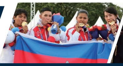
Boosts up the sport enthusiasm 促進國內運動風氣